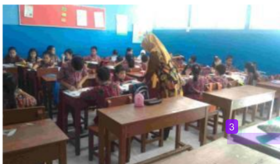
Fig. 1. The implementation of natural science in grade V.

how to do it. It is strengthened with observation result obtained from the observation which was done in Grade V during Natural Science learning in which the teachers have performed special assistance for slow learners as presented in Figure 2. If slow learners experience difficulty in learning, teachers give opportunity to ask. Dwi Rina said that: “If they find difficulty, I will give them chance to ask. If they don't understand, I will explain it again. Sometimes they come to the front and ask for explanation, then I explain. The point is, if students find difficulty, we will guide, direct, and ask the material that has not been understood.”